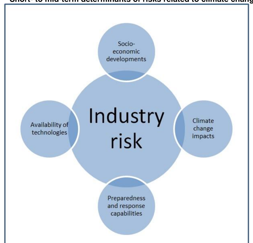
Figure 1: Short- to mid-term determinants of risks related to climate change

Finally, we have characterised the impacts of global warming through high-resolution projections of likely changes in temperature, precipitation and wind speed. Data shortcomings prevented us from using measurement data to validate model outputs (we had to use reanalysis data, which is nonetheless considered to be effective in removing key biases).