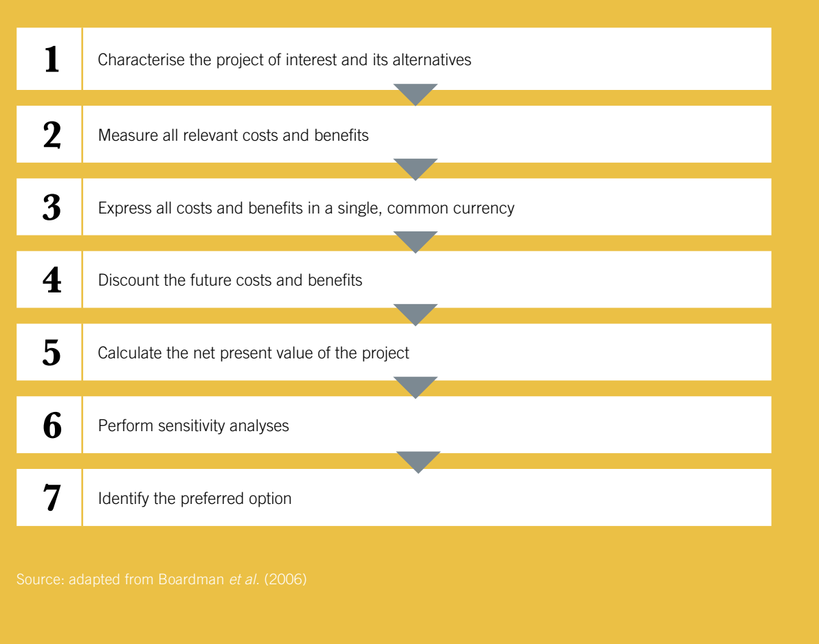
Figure F2.1: Steps involved in conducting a cost-benefit analysis

Figure F2.1 below summarises the main steps involved in conducting a cost-benefit analysis. Although this is a generic representation, most applications would follow all these steps.